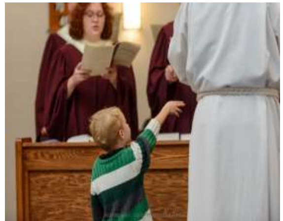
Our next choir conductor in the making.

Read some "Snapshots of Gratitude" on the Diocesan website at http://www.spokanediocese.org/Get%20Involved/united-thank-offering.html