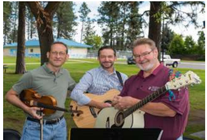
Our musical blessings